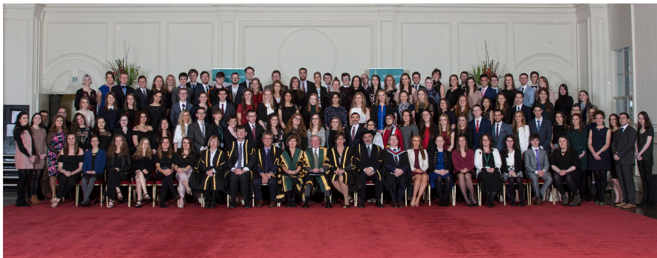
2016 NUI Awards Recipients with Platform Party at the 2016 NUI Awards Ceremony, Royal Hospital, Kilmainham.